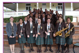
'Queensland Catholic Schools' Music Festival