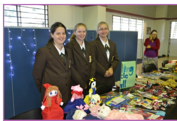
Fair Trade Stall