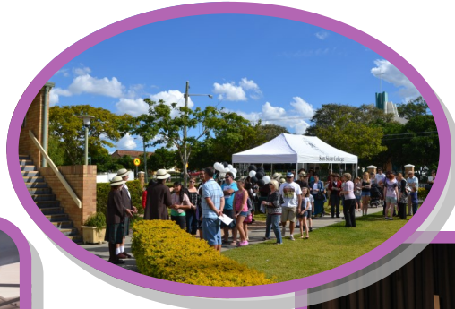
College Open Day