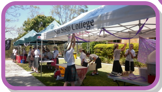
Commerce Market Day