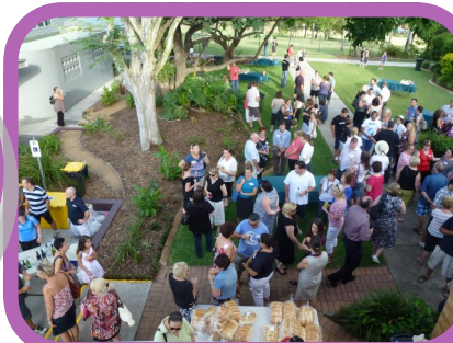
Family Welcome Barbecue