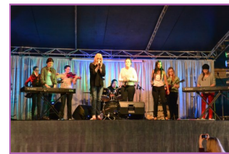
Rock Band performed at Crackerjack Carnival