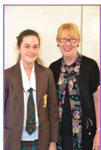
Lions Youth of the Year