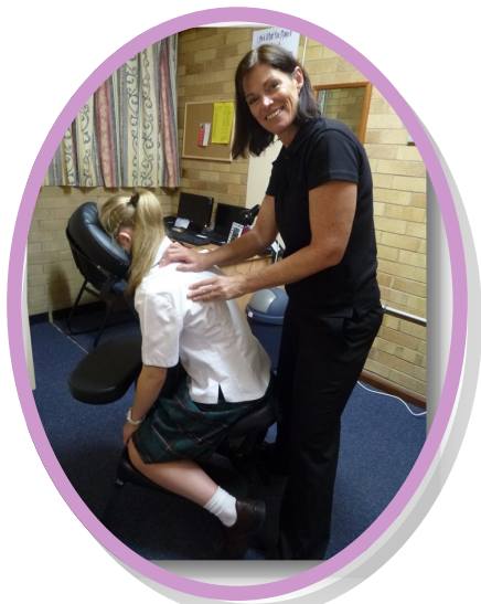
Massage therapist in the W.E.L.L.